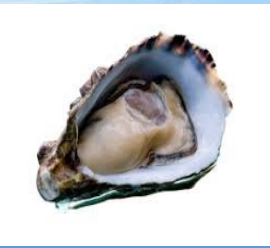
Beautiful Coffin Bay Oysters Sold whole or freshly shucked by the dozen