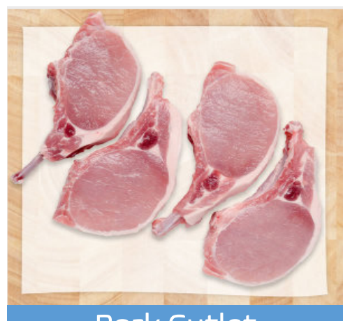
Pork Cutlet Delicious Crumbed