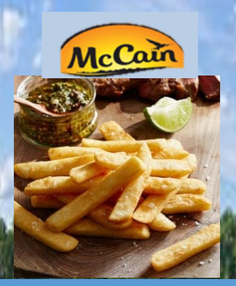
Beer Battered Steak Fries 12kg Carton