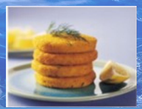
Top Hat Fish Cakes 100g per portions 4kg box Australian Made