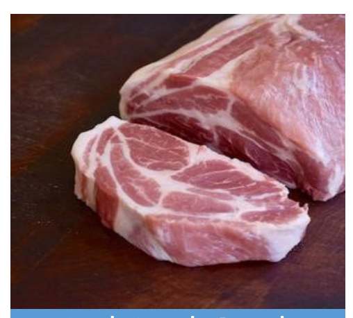
Pork Neck Steak Braise