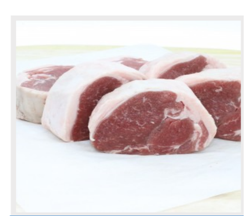
Lamb Noisette Low & Slow