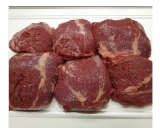
DND Lamb Rump Winter Salad or Roast