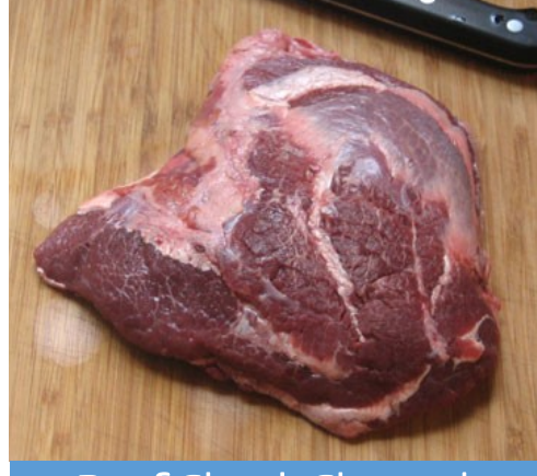
Beef Cheek Cleaned 4 pieces per pack