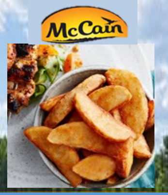
Seasoned Wedges 12kg Carton