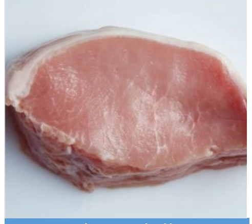
Pork Medallion Mulled Wine Sauce

Don't forget to speak to your sales representative for pricing and many more winter options.