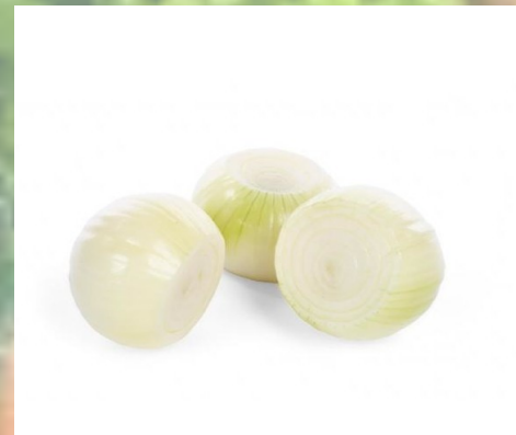
Peeled Brown Onions 10kg Bag