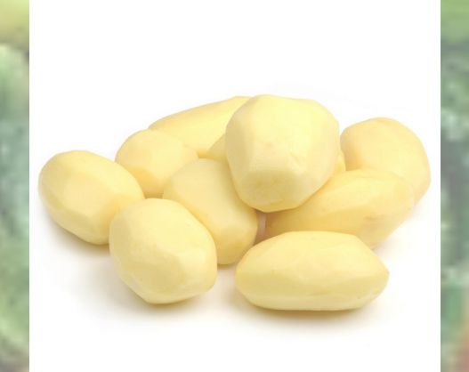
Peeled Potatoes 10kg Bag