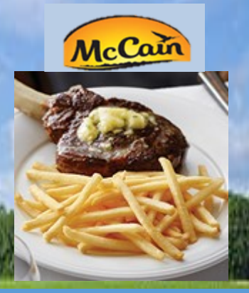
Shoestring Fries 15kg Carton