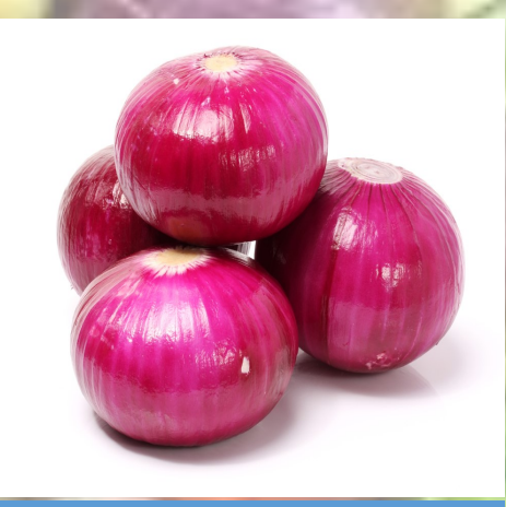
Peeled Red Onions 10kg Bag