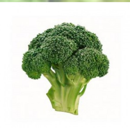
Broccoli Whole 8kg Box