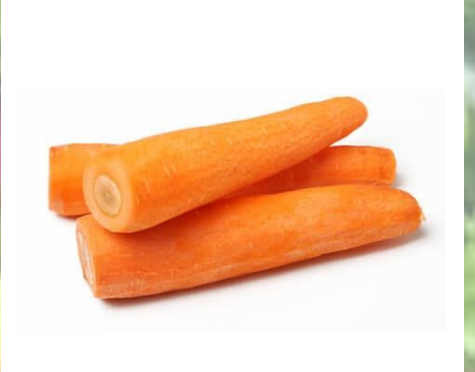
Peeled Carrots 5kg Bags

Looking for diced or stir fry veg mix, maybe even winter vegetable packs? Speak to your sales rep for more information & pricing. Please also allow 48 hours for delivery of these products.