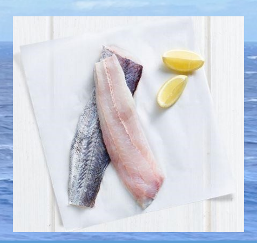
Southern Australian Blue Grenadier fillets. Perfect for pan searing or battered. Try some today.