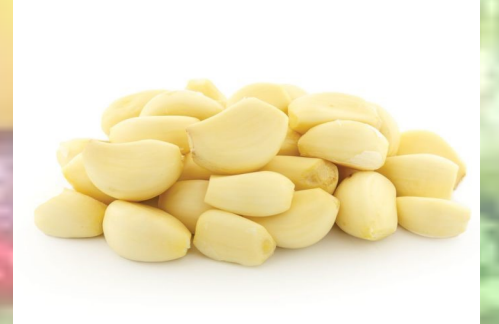
Peeled Garlic Cloves 1kg Bag