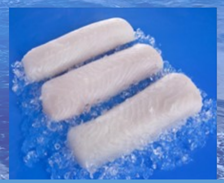
Sea Harvest Capensis Hake Portions 120g x 40 pieces per carton

With a variety of seafood available at your finger tips, speak to us today about your next order. Whether it is fresh or frozen fillets, whole fish, specialty cuts, portion control cuts great for aged care & functions, prawns, scallops, calamari, oysters the list & possibilities are endless.