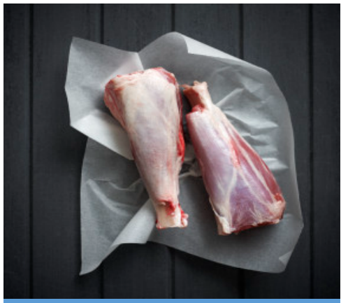
Lamb Shanks French 5 pieces per pack