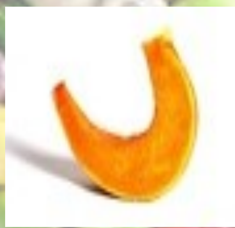
Peeled Kent Pumpkin Wedges 5kg Bag