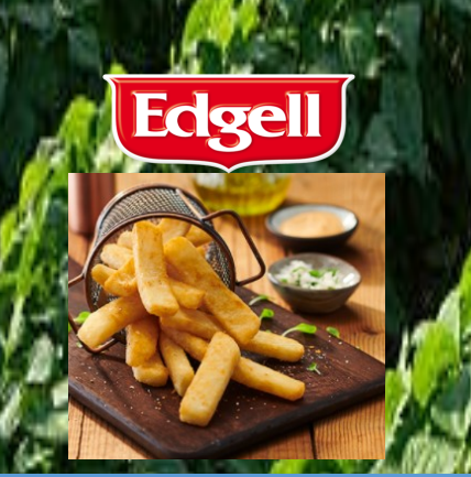
Supa Crunch Steak house 6x2kg 12kg Carton