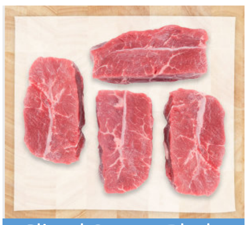
Sliced Oyster Blade Braise