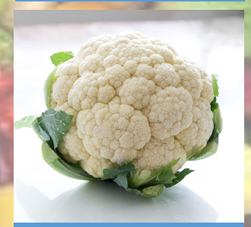
Whole Cauliflower 10 Pieces Per Box