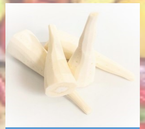
Whole Peeled Parsnips 1kg